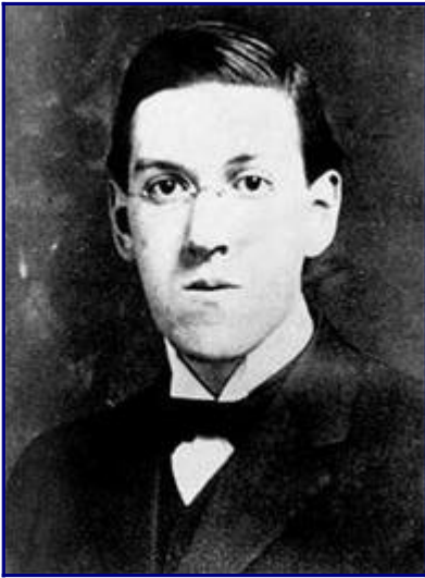
Howard Phillips Lovecraft, 1890-1937

All of this is undertaken – without any notion of paradox – in order to make life more three-dimensional or tragic. Truly, a pessimist and an ultra-conservative who’s on a par with Robert Burton’s The Anatomy of Melancholy , Lovecraft even sees science as grist to his mill. Usually positive enquiry – or evidentialism – is thought of as liberalism’s hand-maiden, but, in Lovecraft’s oeuvre , it can serve as a basis for overthrowing ‘Enlightenment’ nostrums.